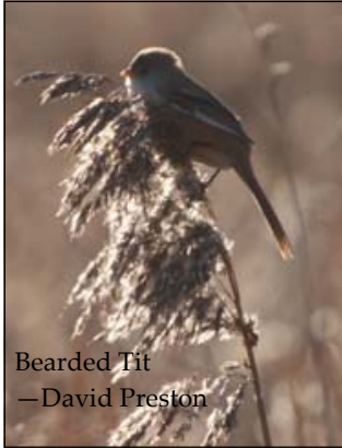
Bearded Tit —David Preston