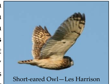
Short-eared Owl—Les Harrison