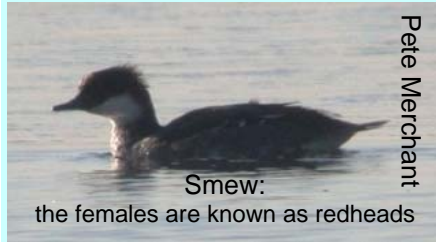
Smew: the females are known as redheads