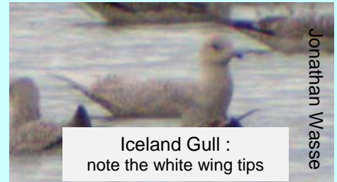
Iceland Gull : note the white wing tips

What's been about: February: The month started well with a flurry of yellowhammers and two riverside corn buntings amongst the carpet of snow. Our two penduline tits reappeared on the 6th and were last seen on the 11th while a pair of bearded tits made sporadic appearances. Gull watching produced several smart Mediterranean , at least six Caspian and two Iceland gulls . A female smew on the 11th was a very rare visitor to the site (there are more records of penduline tit!) but no other unusual wildfowl came in with all the snow and easterly winds.