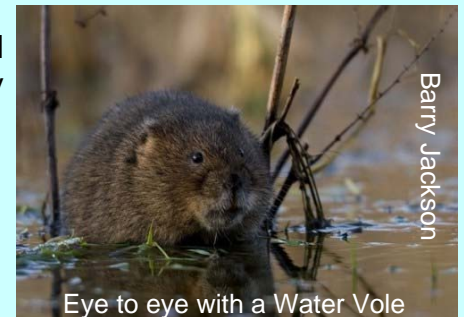
Eye to eye with a Water Vole