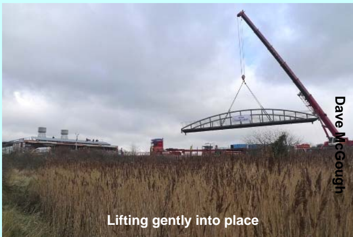
Lifting gently into place