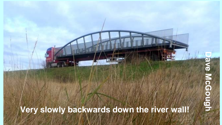
Very slowly backwards down the river wall!

This took just over an hour to bring down and yet only 15 minutes to crane into place! Since then, the finishing touches have been applied and the area around it landscaped.