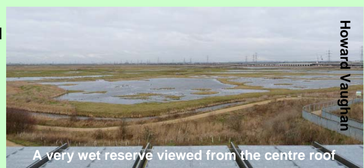
A very wet reserve viewed from the centre roof

Reserve work: Rain has not stopped play with the major construction projects on the marsh and it is hoped that during April the Shooting Butts Hide and the new riverwall access path from our Southern Trail will be completed. February's deluge has left the reserve the wettest since 2003 and as such some of the pathways have been flooded. This (and the mud!) should be a short term problem and wellies should not be required for too much longer. The gardening team have been working hard to get the wildlife gardens in shape for the spring and there are already signs of spring bulbs, pansies and primulas showing their heads. The first bees are checking out willow and hazel flowers but we have yet to see a butterfly.