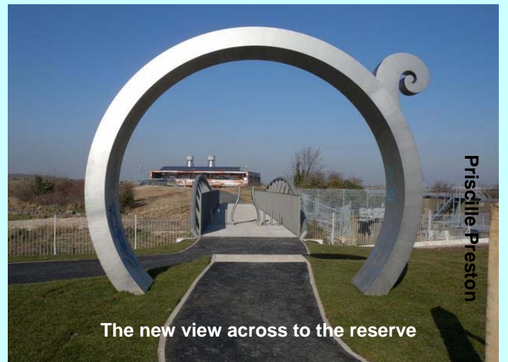
The new view across to the reserve

It is already being well used and not only offers a more immediate link for the local community to our wonderful reserve but allows those visitors who have travelled by train a quicker and more scenic approach.